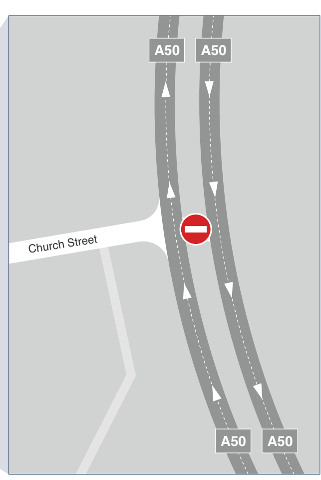
Please do not use the Hilton Hotel access to U turn or short cut through the hotel access. Highways England are currently instigating a mandatory 'No U turn' regulation at this junction.